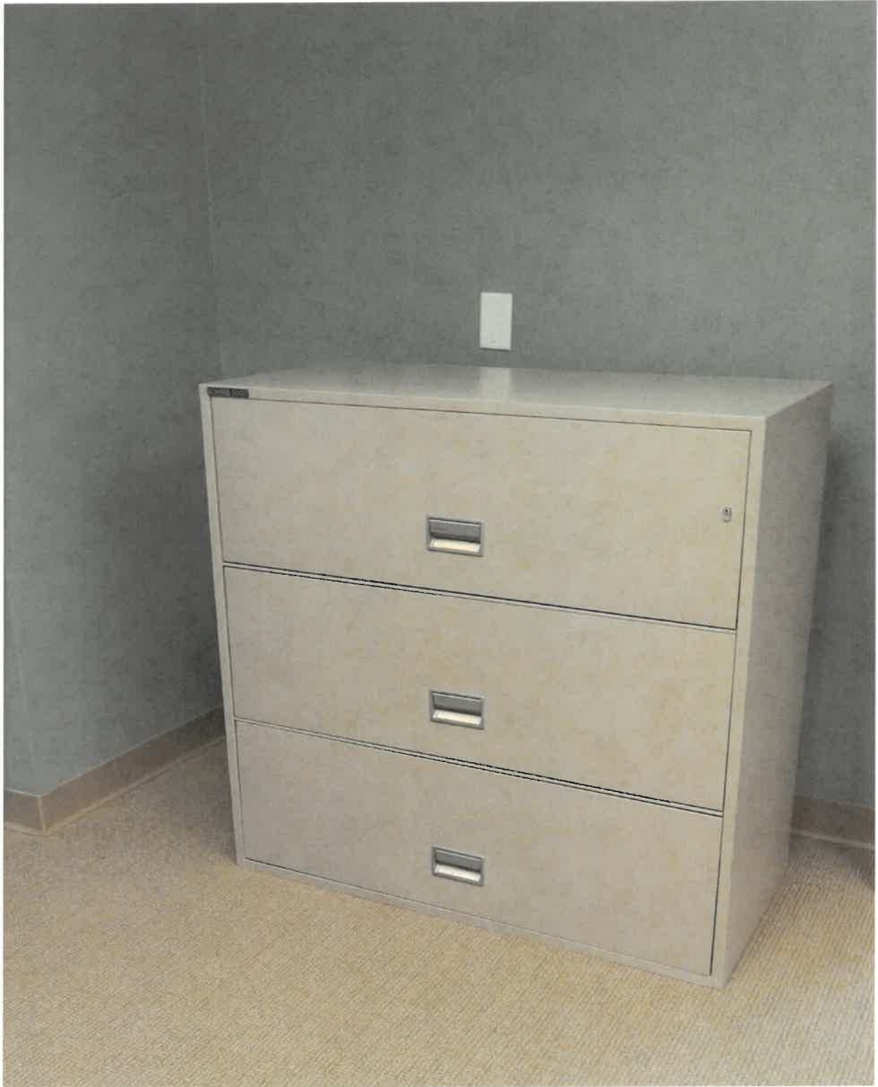
1 File Cabinet: