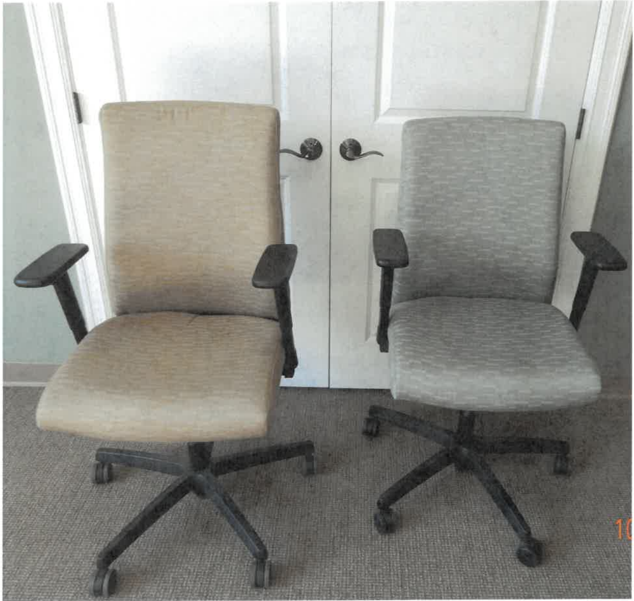
9 HON Office Chairs; 5 Tan & 4 Green