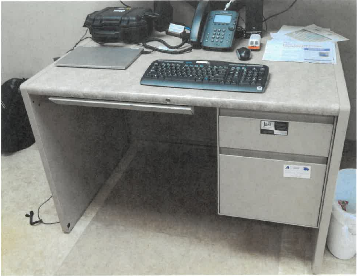
3 Desks (Taupe):