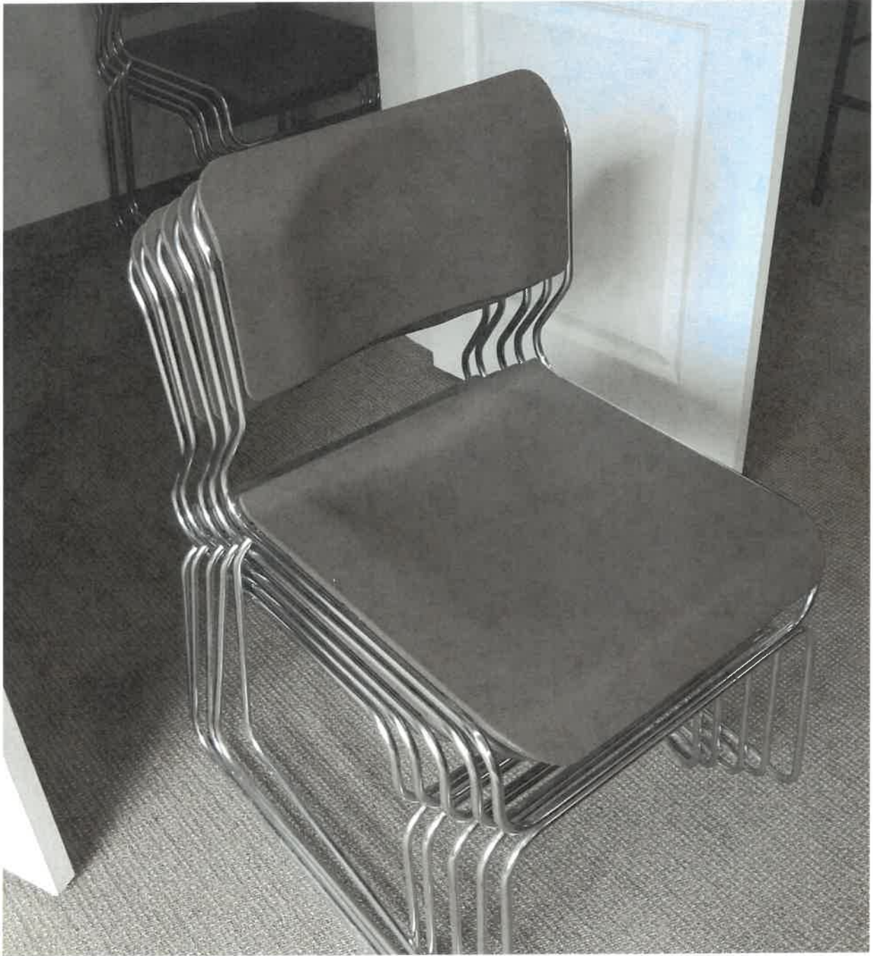
12 Steel Stack Chairs in Taupe.